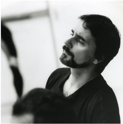
Photographer not known

Dancer and choreographer Jiří Kylián was born in 1947 in Prague, Czechoslovakia.